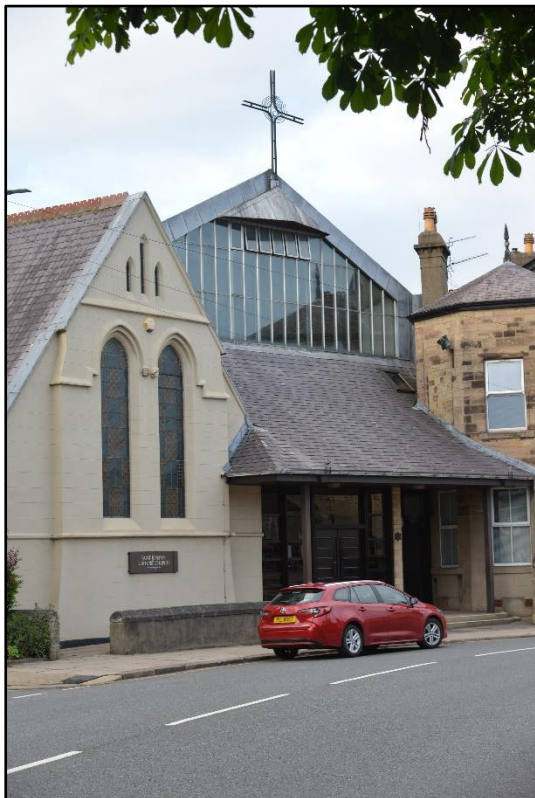
St Joseph's Wetherby